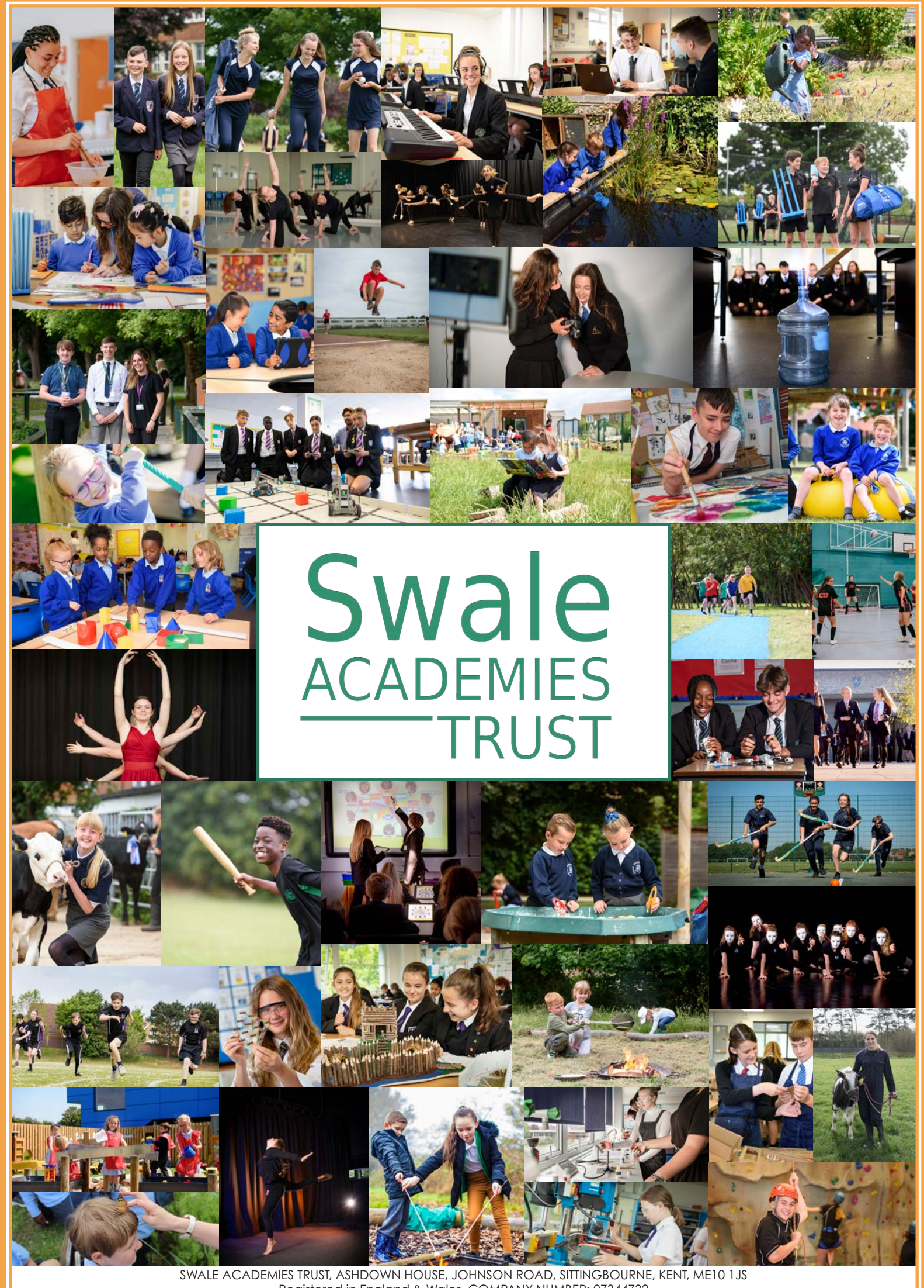
SWALE ACADEMIES TRUST, ASHDOWN HOUSE, JOHNSON ROAD, SITTINGBOURNE, KENT, ME10 1 JS Registered in England & Wales, COMPANY NUMBER: 07344732