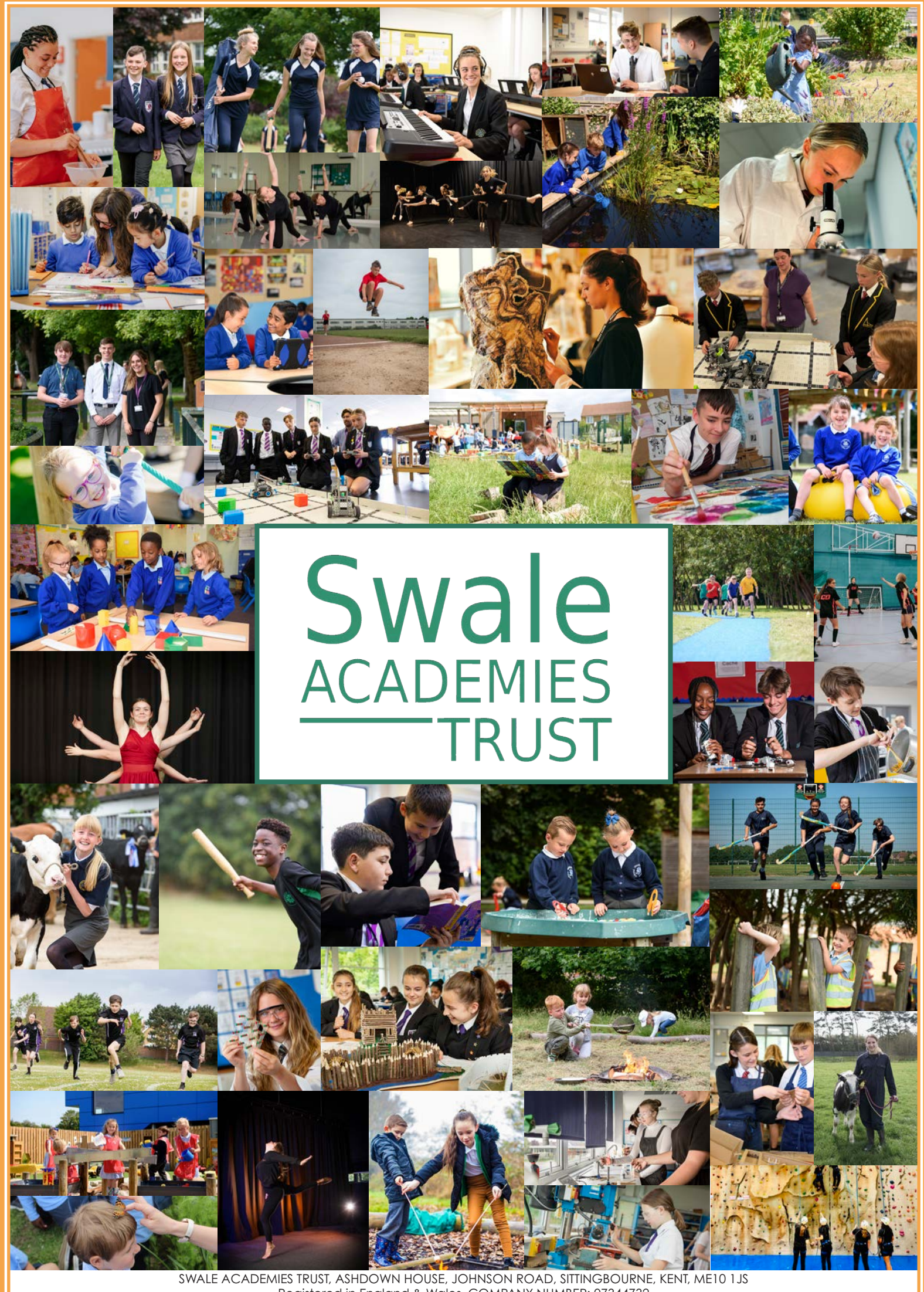
SWALE ACADEMIES TRUST, ASHDOWN HOUSE, JOHNSON ROAD, SITTINGBOURNE, KENT, ME10 1 JS Registered in England & Wales, COMPANY NUMBER: 07344732